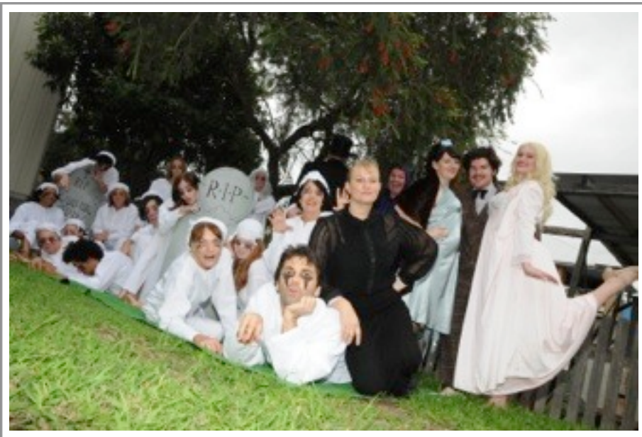
The ensemble, with the backdrop from the opening scene.