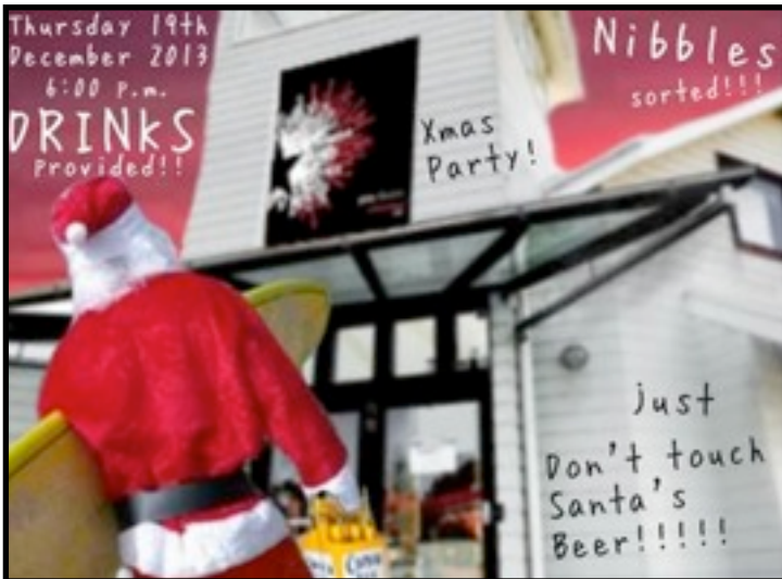
Members welcome at the Jetty Theatre's Christmas Party!