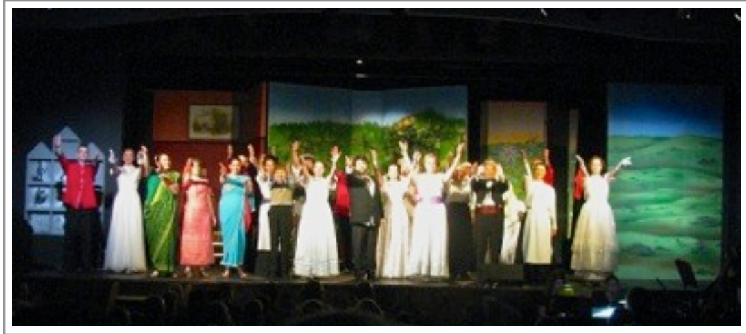
The Secret Garden - Finale