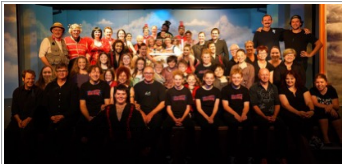
Left: Chitty Chitty Bang Bang Company