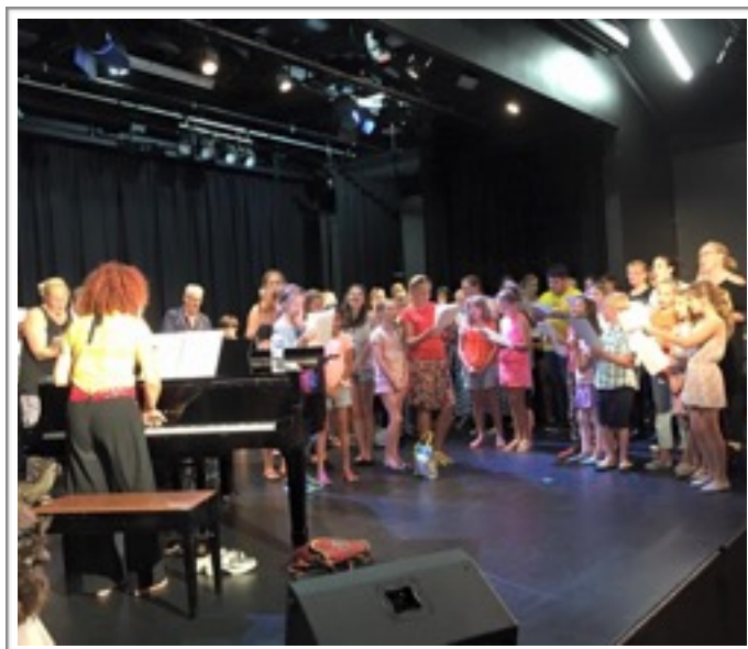
Vocal Workshop learning "Seasons of Love" from Rent

I was blown away by the interest in my Vocal Workshop, over 40 people of all ages and abilities took part, and although we only managed to learn one of my two prepared songs ("Seasons of Love"), I think we all had a lot of fun. I am thinking of holding an informal singalong as a social event, open to everyone, where we can learn my second song, "Do You Hear the People Sing". Please keep an eye on our Facebook page and Website for the details.