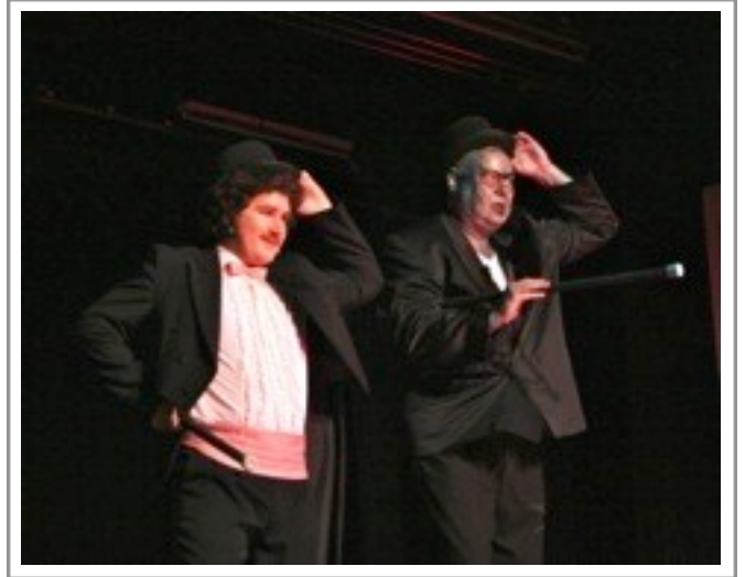
Dr Frankenstein with a cultured, sophisticated Man about Town