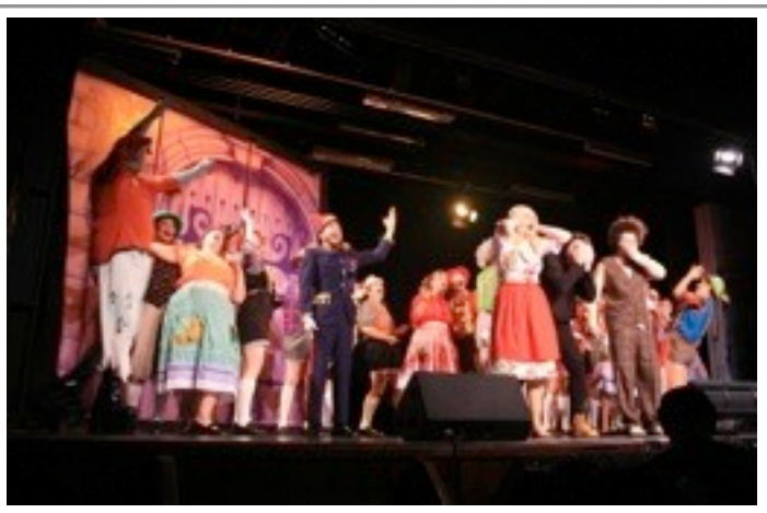
The Creature breaks loose!